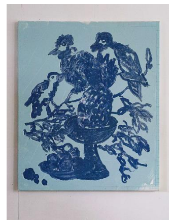
Jean-Baptiste Maitre, Birds over Ananas , 2021, acrylic and ink on canvas, 75x90 cm