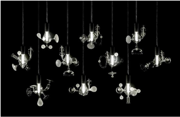
Martinelli Venezia, UNSERIALS.bulbs , 2021, mouth-blown boron silicate bulb, variable dimensions