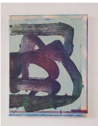
Jean-Baptiste Maitre, B for Brushstroke , 2020, acrylic and ink on canvas, 35x45 cm