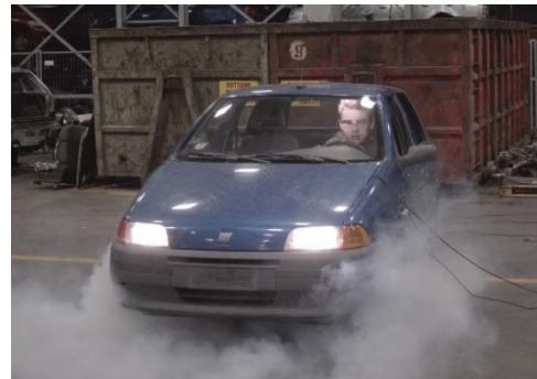
ZAPRUDER filmmakersgroup, Amore Brucio , 2021, Lobby set da Zeus Machine, photographic print, 50x70 cm