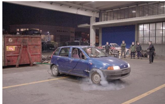
ZAPRUDER filmmakersgroup, Amore Brucio , 2021, Lobby set da Zeus Machine, photographic print, 70x110 cm