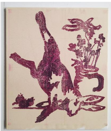
Jean-Baptiste Maitre, Landing Hare with Flowers , 2021, acrylic and ink on canvas, 80x95 cm