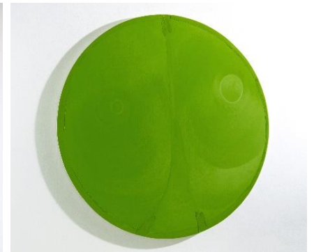
Antonio Catelani, Flying Kisses (rosa/verde) , 2020, oil on canvas, 80 cm ø