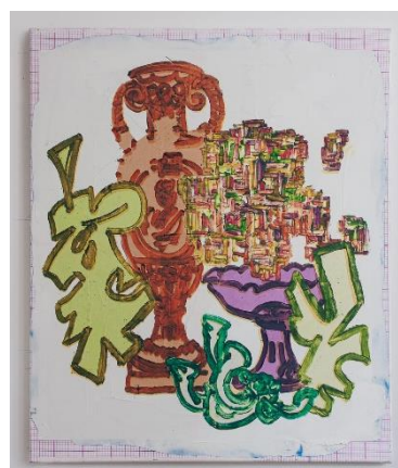
Jean-Baptiste Maitre, Imperial Vase with Digital Bouquet , 2021, acrylic and ink on canvas, 75x90 cm