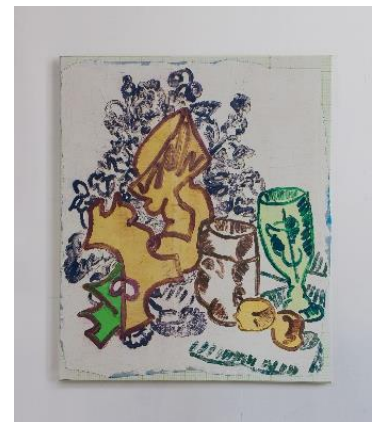
Jean-Baptiste Maitre, Drinks with Lemons , 2021, acrylic and ink on canvas, 75x90 cm