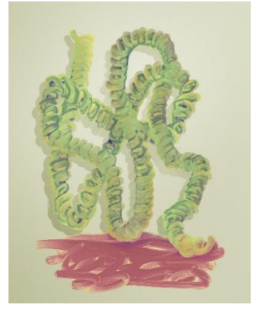
Jean-Baptiste Maitre, Telephone Conversations (Cord 1/2/3) , 2021, digital painting, lambda print on kodak paper, 40x50 cm